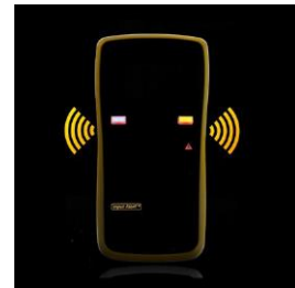
Wrong Operation Scenario