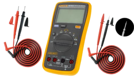
15B MAX KIT