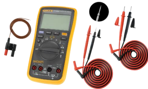
17B MAX KIT

Fluke. Keeping your world up and running.®