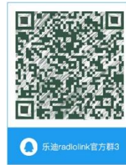
Ledi official group 3