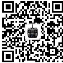
Ledi WeChat public platform

Suggestion: When you read this manual, please turn on the remote control and receiver and connect the receiver to the servo and other related equipment, and operate while reading. If you encounter difficulties when reading these instructions, please refer to this manual or call our after-sales service (0755-88361717) or log in to our official website or communication platform ( www.radiolink.com , Radiolink official group, Radiolink WeChat public platform) to view relevant questions and answers.